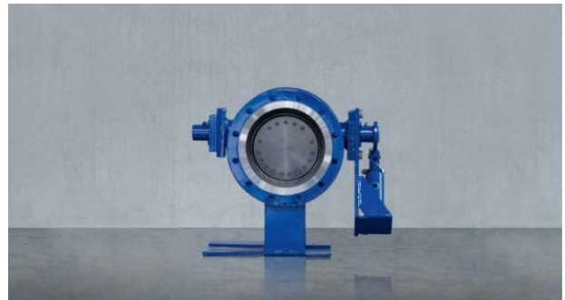
Check Valves of the series TRI-CHECK