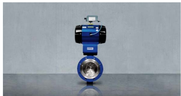
Control fitting with the specially designed Sharktooth attachment TRI-SHARK

For further information please visit our website. If you have any questions, please do not hesitate to contact us.