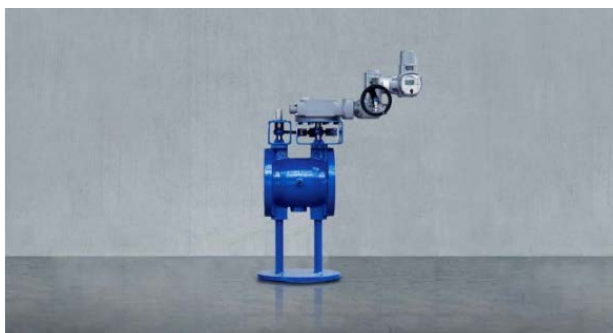
Double Block and Bleed versions of the TRI-BLOCK series