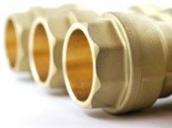
Product sample ISIFLO brass

Isiflo universal couplings from 16 mm to 63 mm outside diameter are certified in accordance with G 5600.1 for the gas sector (only in conjunction with conversion kit gas type 990 and pipe booster type 180) in accordance with DIN 8076 for the water sector up to 90 mm outdoor diameter.